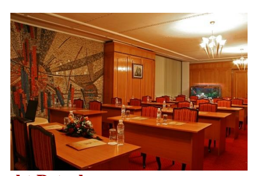
Park Hotel Sankt Peterburg