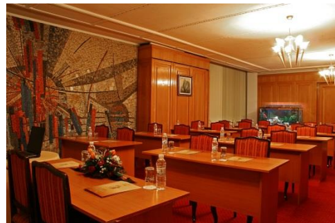
Park Hotel Sankt Peterburg